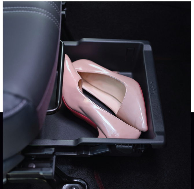
Front Seat Under Tray