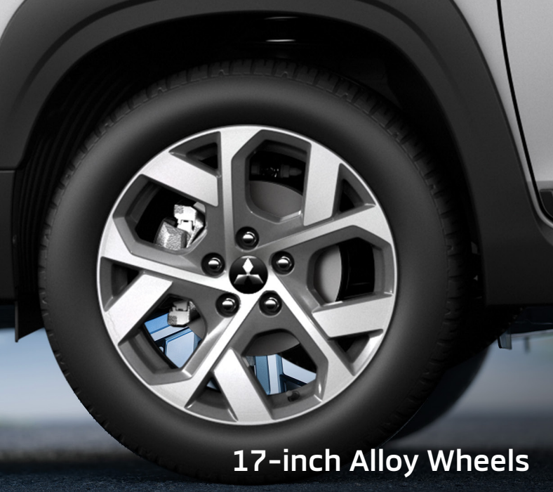
17-inch Alloy Wheels