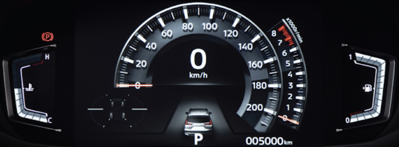
8" Full Color LCD Meter