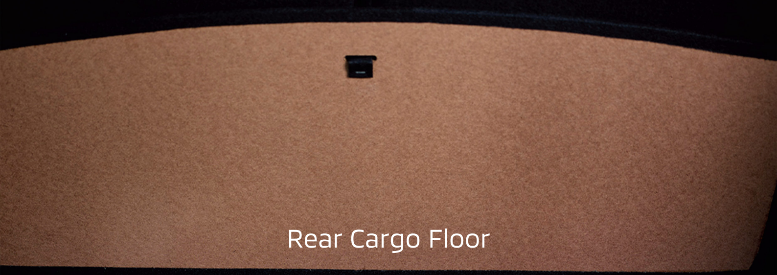
Rear Cargo Floor