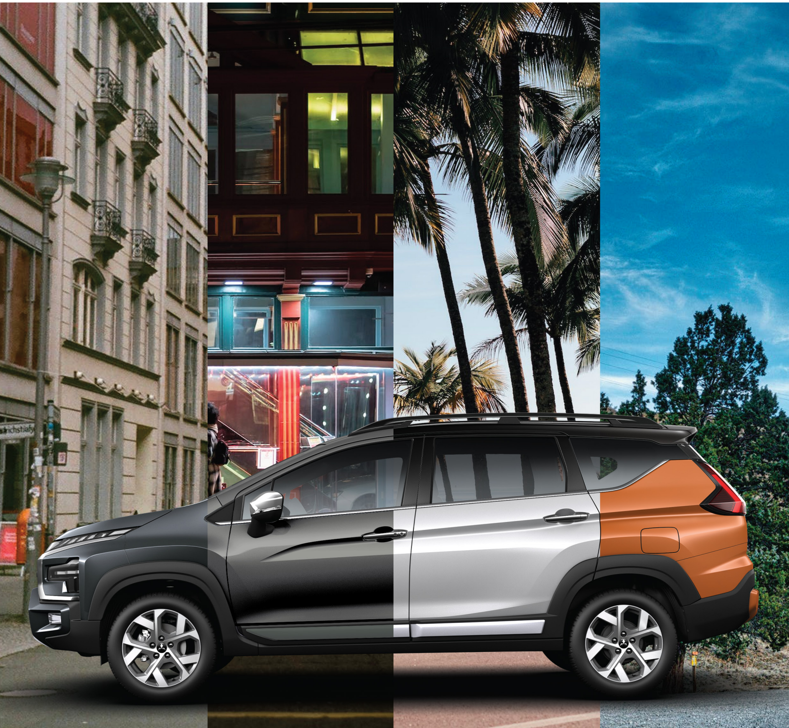
(Monotone) Graphite Gray Metallic