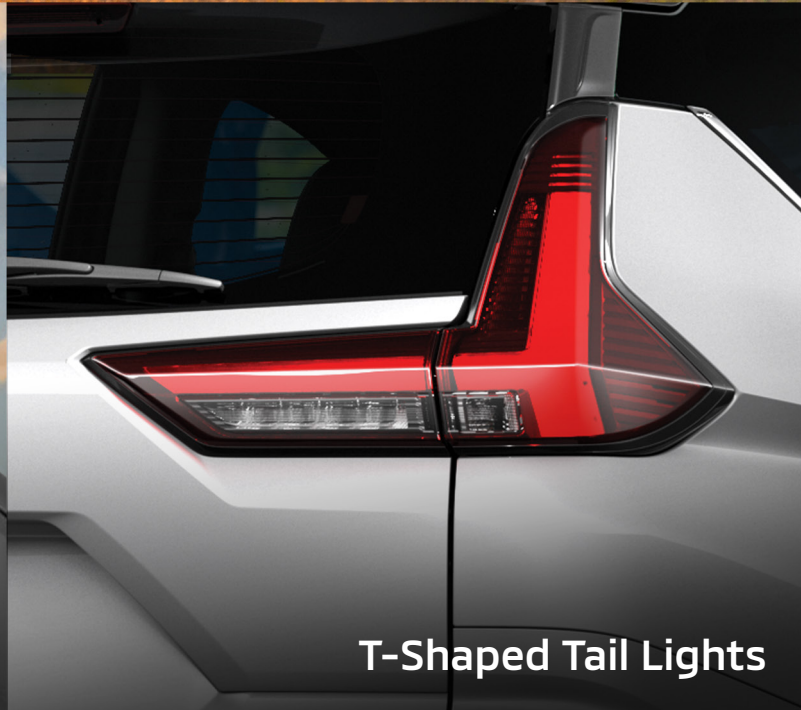
T-Shaped Tail Lights